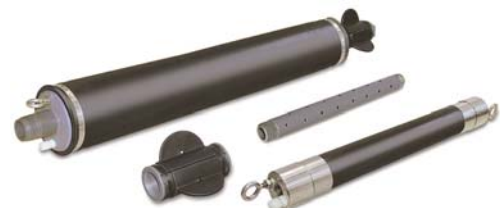
Model 800 Packers 3.7" and 1.8" (94 mm and 46 mm)

Model 800 Low-Pressure Packers can be used with Integra Pumps to minimize purge times by reducing purge volumes. This reduces the cost of water disposal and labour. Packers are available in single point or straddle packer designs, and in sizes to fit 2" (50 mm) to 5" (127 mm) dia. wells. (See Model 800 Data Sheet.)