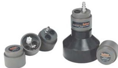
Dedicated Well Caps 2" and 4" (50 mm and 100 mm)

The caps slip easily onto 2" dia. (50 mm) wells. Adaptors to fit 4" dia. (100 mm) or other well sizes are also available. The cap seals in place with an o-ring, and comes with a wire connected protective cover. Low profile wellheads are also available for flush mount casing applications.