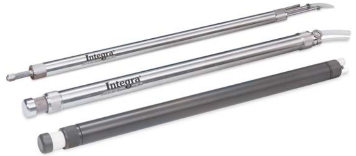
Integra Bladder Pumps available in Stainless Steel 1" and 1.66" (25 mm and 42 mm) or PVC 1.66" (42 mm)

The pump body of the standard Integra is a convenient 1.66" dia. (42 mm) and comes in lengths of 2 ft and 4 ft (0.6 m and 1.2 m). 1" dia. (25 mm) bladder pumps are also available for narrower applications and for use in the Waterloo Multilevel System. (See Model 401 Data Sheet.)