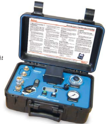
Electronic Control Unit Model 466

The pump is quick to disassemble and the bladders and screens are simple to replace in the field. No tools required. Inexpensive polyethylene bladders can be quickly replaced to suit regulatory requirements.