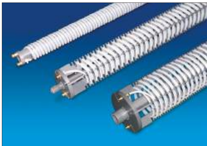
1.8", 3.8" & 5.8" Waterloo Emitters