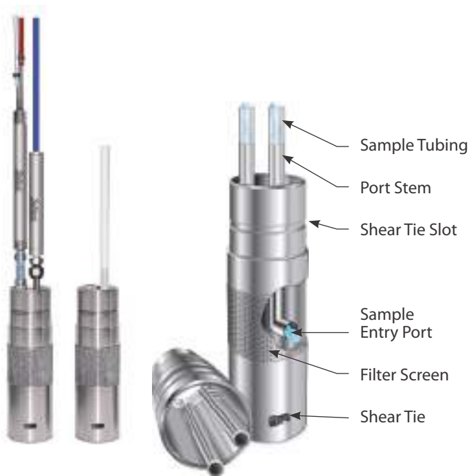
Stainless Steel Ports