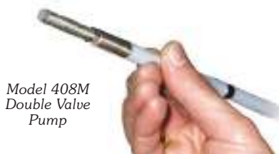
Model 408M Double Valve Pump

Dedicated Bladder and Double Valve Pumps, (DVP), as well as a portable DVP are ideal for use when low flow sampling and purging techniques are desired.