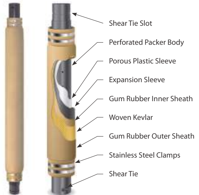
Permanent Waterloo Packer