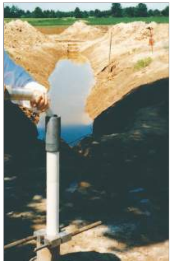
Underground oil pipeline leak assessment. Three 150 ft. (45 m) installations. Two point rising head permeability tests were conducted in each interval of the Multilevel System. (See diagram showing contaminant distribution at left.)