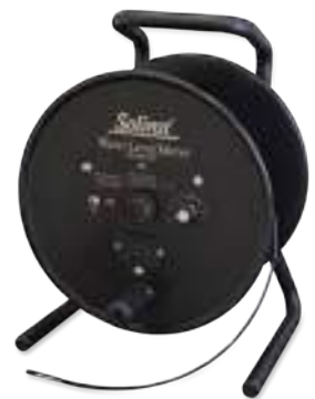
Model 102 P4 Water Level Meter

Sampling may be performed in open tubes using a Mini Inertial Pump, Micro Double Valve Pump, or a Peristaltic Pump.