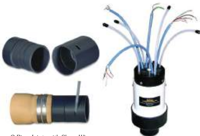
O-Ring Joints with Shear Wire