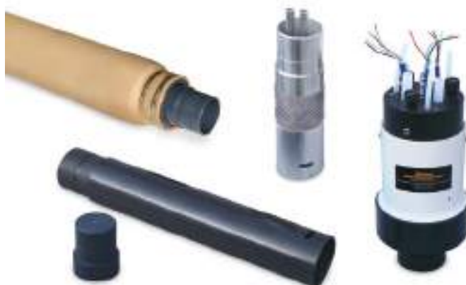
Standard Waterloo System components, including Packer, Port (Dual Stem), PVC Casing, PVC Base Plug, and Manifold.

The manifold allows connection to each dedicated transducer in turn, and a simple, one-step connection for operation of pumps. When dedicated pumps are selected, a unique wellhead allows individual zones to be purged separately, or purging of many zones simultaneously to reduce field times.