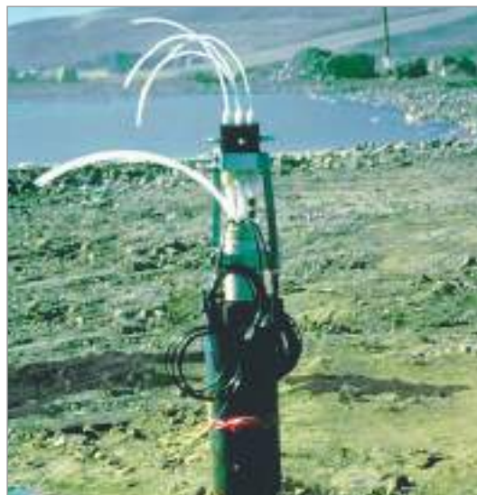
Landfill site over fractured granite, monitored with five Waterloo Systems. Each System comprised of dedicated Double Valve Pumps and Pressure Transducers in 4-6 intervals to depths of 275 feet (84 m). The Multi-Purge Manifold allowed the monitoring of 21 zones to be completed in less than 2 days.