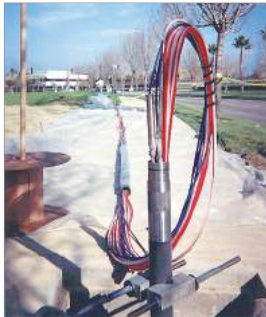
Contaminant investigation at a U.S. Air Force Base. Waterloo Systems installed to 700 ft. in overburden using screened and cased wells. Up to 6 zones per hole with dedicated pumps and transducers.