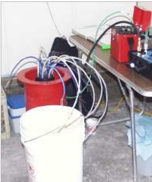
Four Waterloo Systems were installed to monitor a chlorinated compound release. Systems were installed at depths ranging from 430 ft - 750 ft, with most monitoring 7 zones. The Ports were constructed with both Double Valve Pumps and Vibrating Wire Transducers.