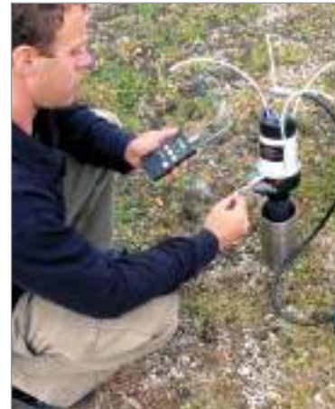
Collecting a sample from a dedicated DVP and taking pressure measurements with Model 404 Geokon Vibrating Wire Readout (above).

The Micro Double Valve Pump (Micro DVP) provides high quality samples, uses coaxial PTFE tubing, and is small enough to fit in 1/2" (13 mm) ID tubing. The unique combination of flexibility and size make the pump ideal for sampling at depth in small flexible tubes.