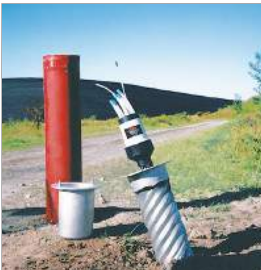
An investigation of hydraulic properties beneath a large waste site. Waterloo Multilevel Systems were chosen to allow water quality sampling and to help determine the zones of highest permeability within the aquifer.